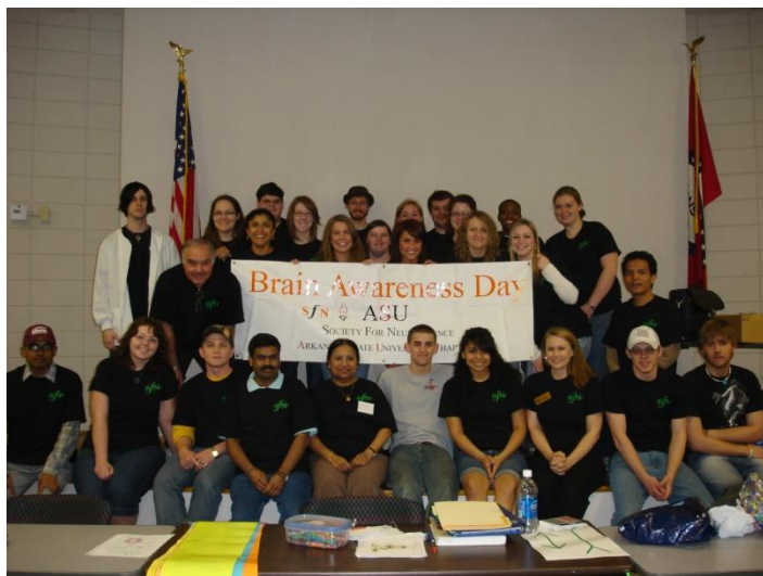
Figure 2. Our volunteer group ranges from 20-30 high school, undergraduate and graduate students as well as university faculty representing many disciplines.

The key to offering our program on such a limited budget comes from our extensive volunteer group consisting of undergraduate and graduate students and faculty representing the areas of psychology, biology, chemistry, nursing, engineering, physical therapy, and environmental sciences (Figure 2).