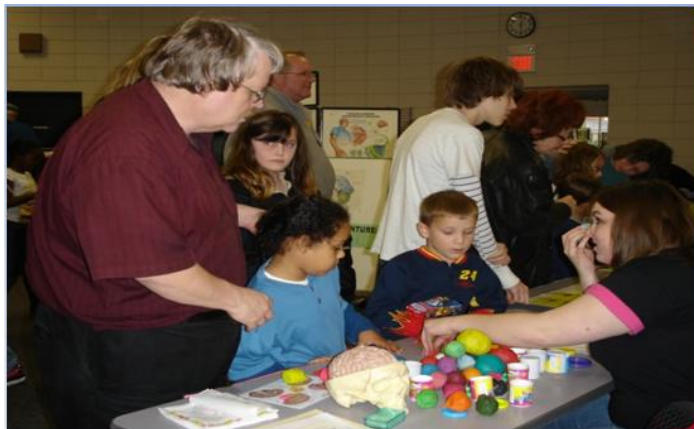
Figure 1. Attendees make a brain model out of play-dough.

During our first year of the program we secured about $300 in funding from the university's Student Government Association. Most of this went toward the purchase of t-shirts for volunteers, promotional flyers, and materials for activities. However, for many of the activities, the volunteers either collected the necessary materials or spent about $5.00 out of their own pocket. Most activities employed inexpensive, second-hand, or common items to demonstrate basic functions of the nervous system. For instance, a ruler and stop watch were used to gauge reaction time and items for visual memory tests were selected from volunteers' personal items. The library also donated play-dough for a make a brain activity (Figure 1) and we secured prizes and food from local bookstores, grocers, and restaurants.